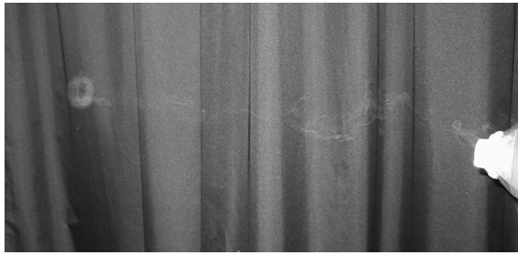
Figure 2: A smoke ring launched from the air cannon.

toroidal vortex generated by the air cannon, and it shows that the vortex can carry particles that exist around the aperture when the air cannon launches the air. The schematic of a toroidal vortex is shown in Figure 2. It is not necessary for the scent generator to fill the chamber with scented air: it only has to spray the scent just before the air cannon launches a clump of air. Thus we can send a different scent with each launch and cover multiple users with a single air cannon.